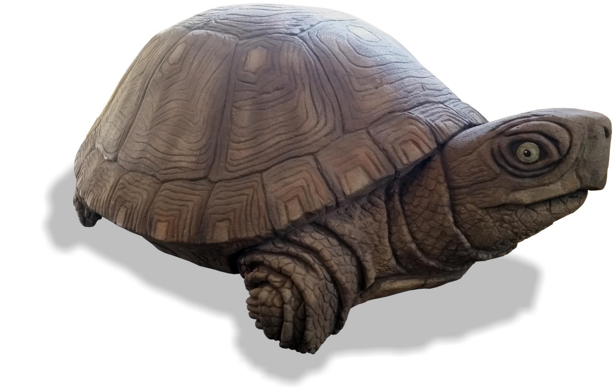
3 Box Turtle_TC028